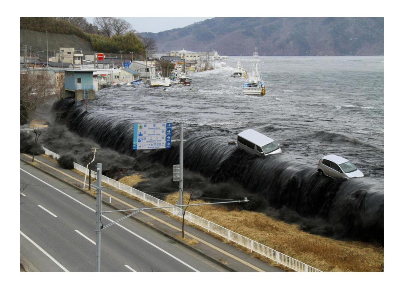
Tsunami overtopping seawall defence in Miyako, Japan, 11 March 2011