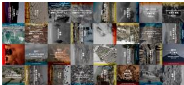
A part of the disaster image projected on the screen called the cloud