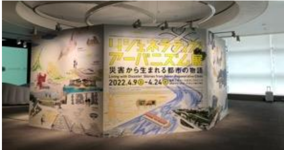
Exhibition hall entrance

Tokyo University (Japan) / Tsinghua University (China) / University of California, Berkeley [UC Berkeley] (US) / University of California, Los Angeles [UCLA] (US) / Pontifical Catholic University of Chile (Chile) / University of Hongkong (Hong Kong) / University of Washington (US) / Melbourne University (Australia) / National Cheng Kung University of Taiwan (Taiwan) / National University of Singapore (Singapore) / Tohoku University (Japan)